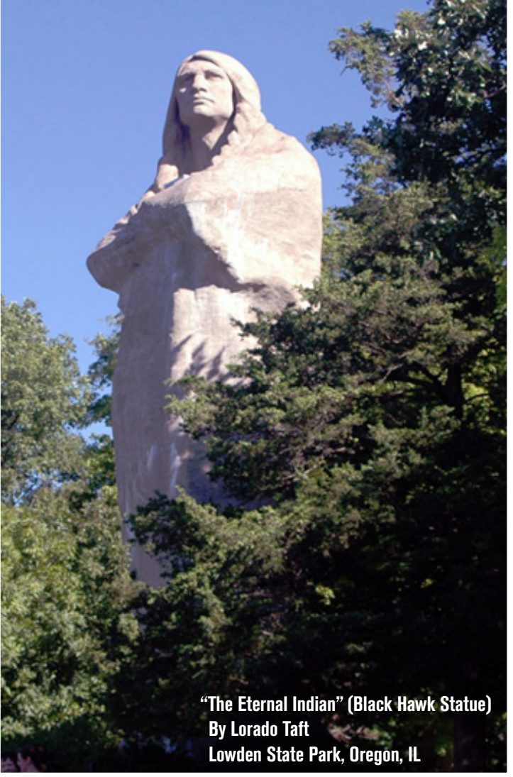
“The Eternal Indian” (Black Hawk Statue) By Lorado Taft Lowden State Park, Oregon, IL