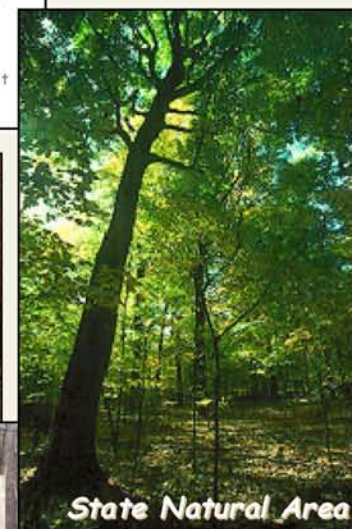
State Natural Area